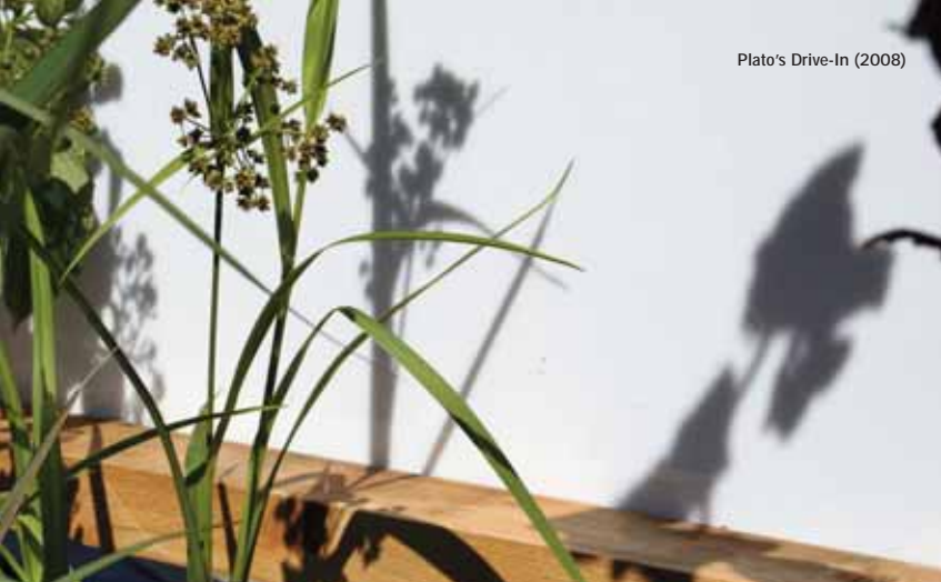
Plato's Drive-In (2008)