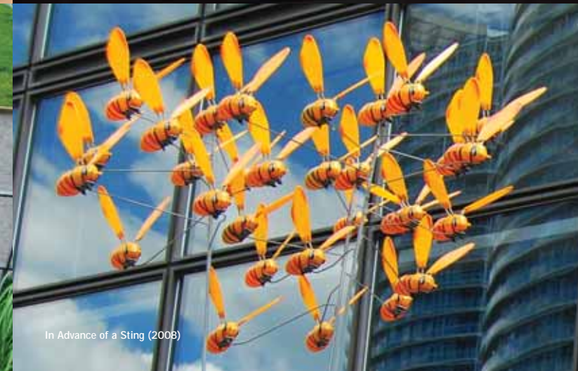
In Advance of a Sting (2008)