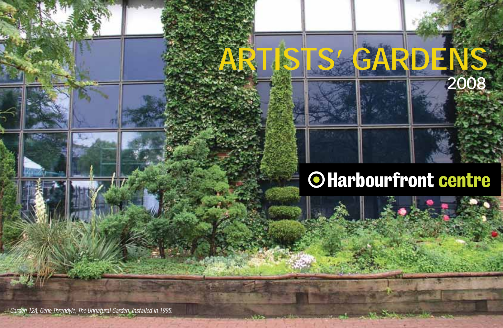
Garden 12A, Gene Threndyle, The Unnatural Garden, installed in 1995.