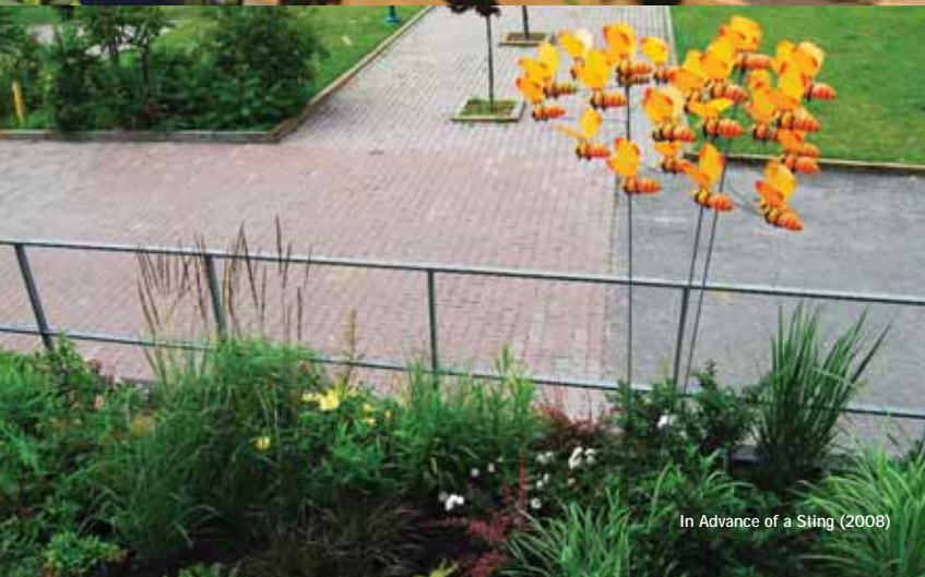
In Advance of a Sting (2008)