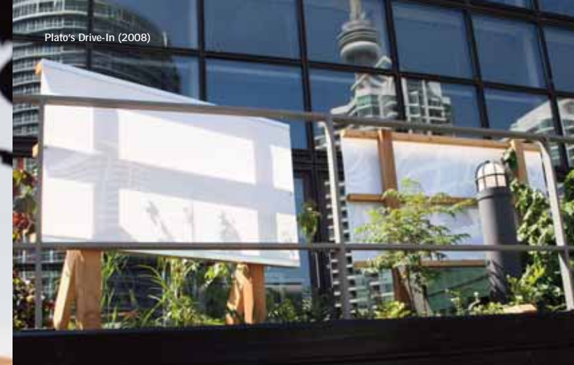
Plato's Drive-In (2008)